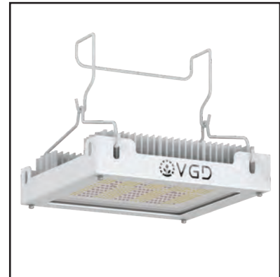
view depends on options