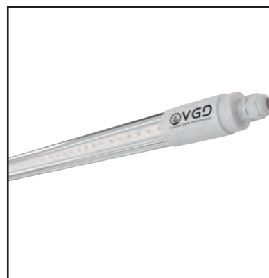
view depends on options